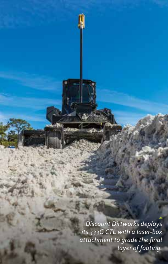
Discount Dirtworks deploys its 333G CTL with a laser-box attachment to grade the final layer of footing.