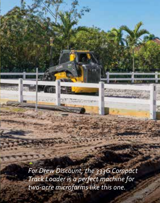
For Drew Discount, the 333G Compact Track Loader is a perfect machine for two-acre microfarms like this one.