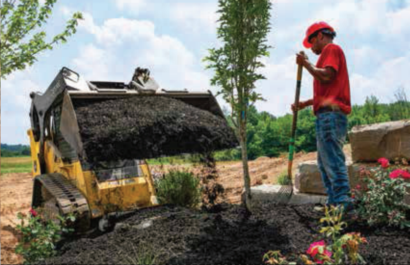
◀ The jack-of-all-trades 317G can quickly switch from forks to buckets to mulching head and more to tackle whatever task is at hand.