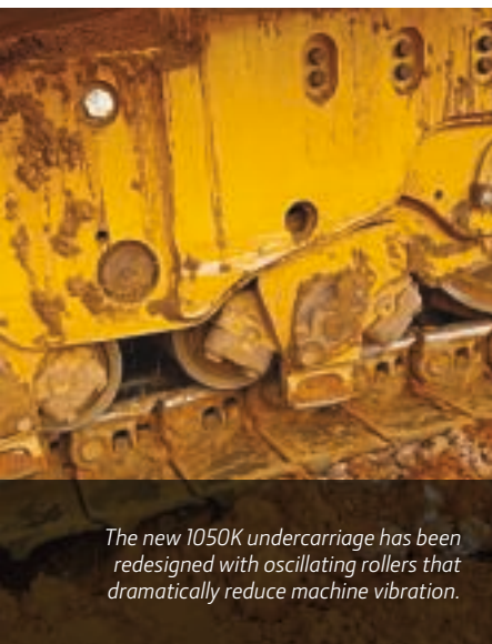
The new 1050K undercarriage has been redesigned with oscillating rollers that dramatically reduce machine vibration.

"This dozer is a different animal. When you run over a rock, it's not jerky or abrupt. It's much smoother than previous models." — Cole Babic, operator, Stout Excavating Group